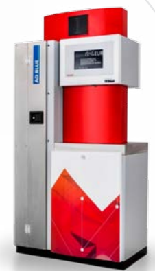
OCEAN Line WAVE