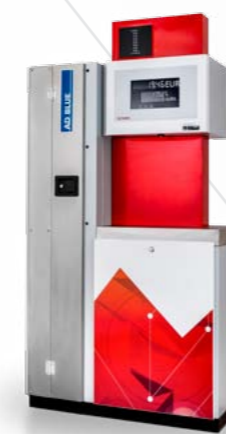
OCEAN Line CUBE