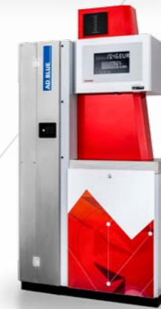
OCEAN Line FIN